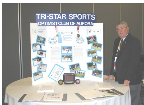
Our Display at the International Convention in Montreal