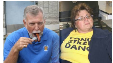
(Our Presidents – current and future)

The oldtimers breakfast was a rollicking fun time as was the Governor's celebration.